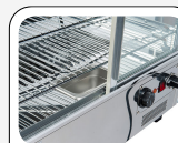
Stainless steel basement