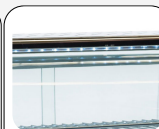
Inner LED light