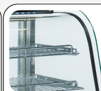
Double glass to reduce dispersion