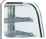
Double glass to reduce dispersion