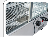
Stainless steel basement