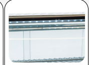
Inner LED light