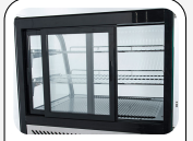
Rear sliding doors