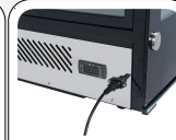
Stainless steel basement with digital controller