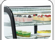
Inner LED light