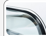
Lateral and frontal curved glasses