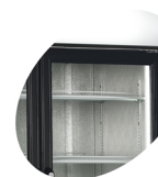
Vertical internal light