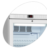
Thermostat with audible and external alarm